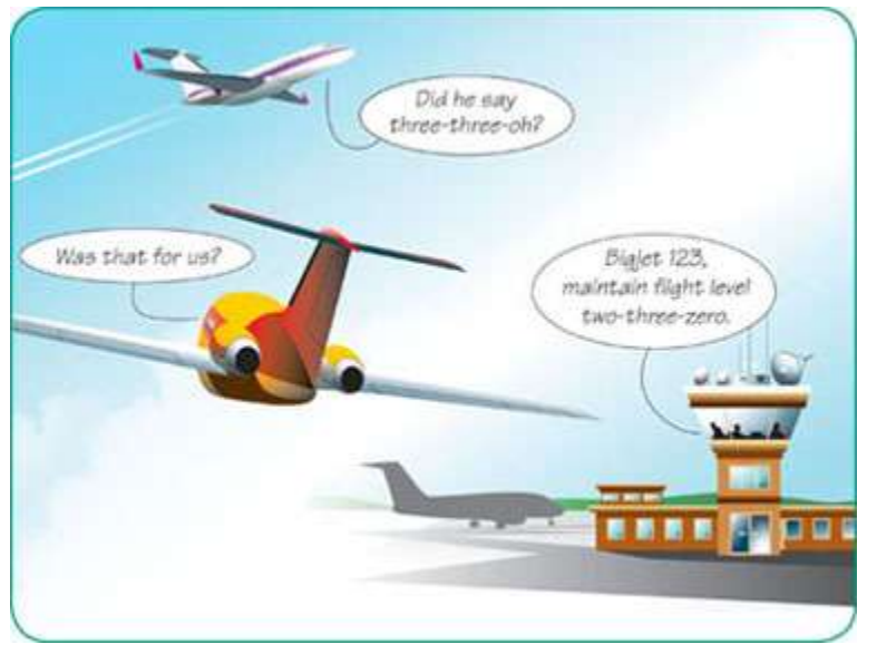
The result of failing to listen

One of my challenges as a flight instructor is getting my student pilots to talk on the radio and convey the correct information in an error-free and efficient manner.